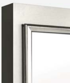
TS-19 | PYLON SERIES