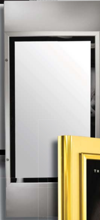
TS-19 | ETS-18