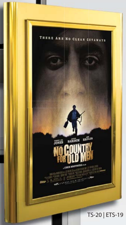
TS-20 | ETS-19