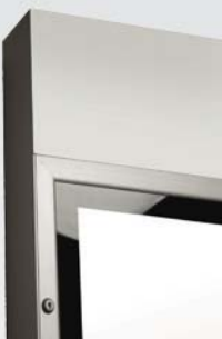
ETS-18 | PYLON SERIES