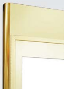
ETS-19 | ROYAL SERIES