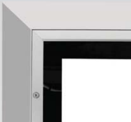
ETS-4 | ANGULAR SERIES