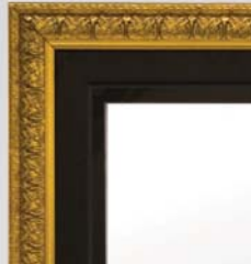
ETS-9 | MUSEUM SERIES