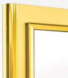
TS-20 | ROYAL SERIES