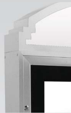
ETS-16 | ART DECO SERIES